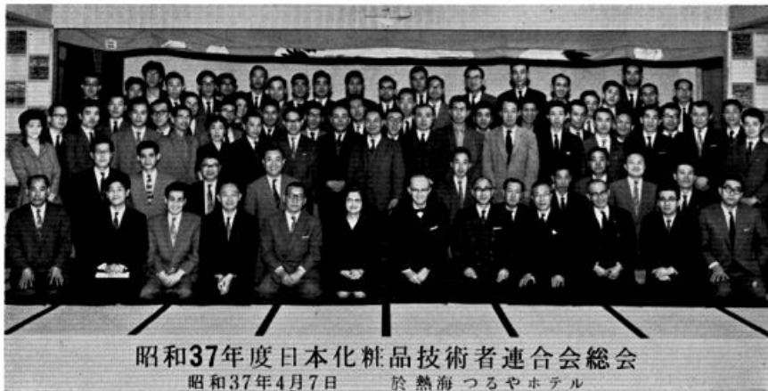
Officers and members of the Japanese Society of Cosmetic Chemists. Officers and "guests" kneeling.